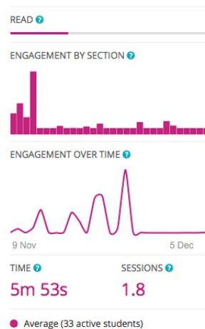
Figure 2. Lighthouse per-resource learning analytics

The dashboard shows for each resource, how many students have engaged with the material (as in any form of viewing at all), how many sessions on average, the average proportion the document viewed (available in several platforms) and a histogram showing for each part of the document the number of students who have viewed it. The latter makes it possible to tell the difference, for example, between all students viewing half of a document vs. half the students viewing it all, and half opening it on the first page and giving up straight away. This can be particularly valuable for identifying 'hot spots' points in the document or video where students give up, or maybe repeatedly re-read or re-view.